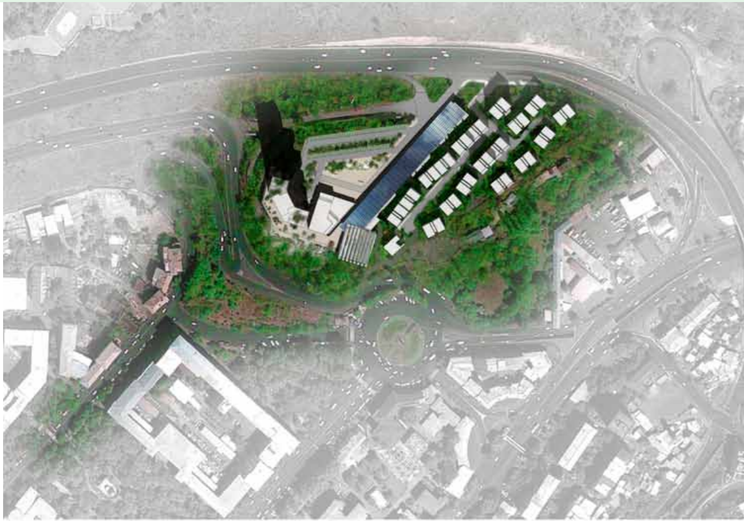
SITUATION PLAN - 1/1000

International Business Center with an Intercontinental Hotel